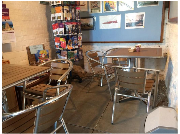
The Refreshment Area