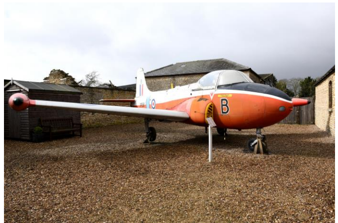
Jet Provost in the Courtyard