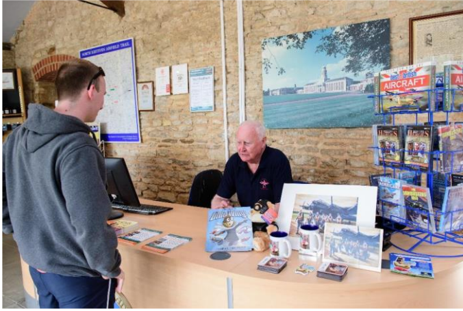
The Reception Desk