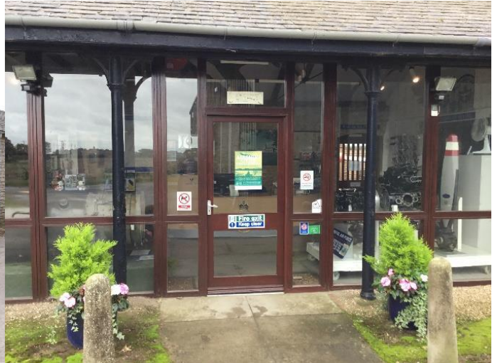
Views of our Main Entrance