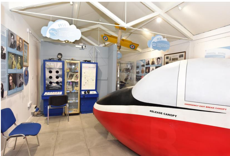
Some of the artefacts and the flight simulator