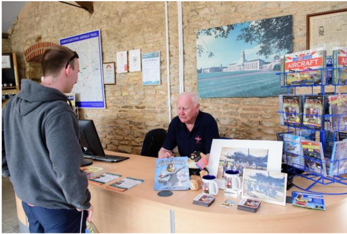
The Reception Desk