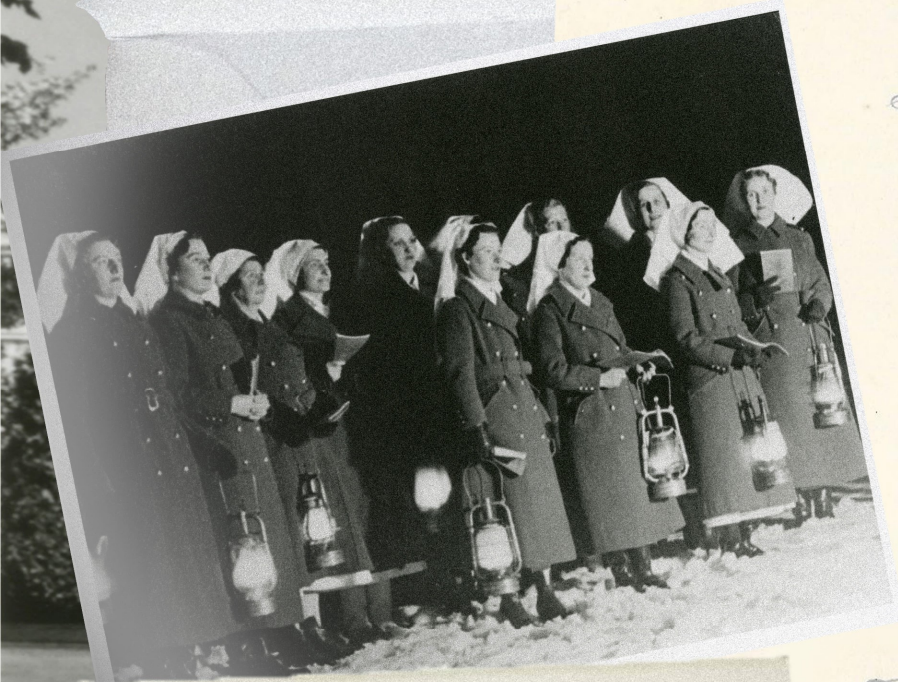
Join the RAF sisters in harmony at RAF Rauceby Hospital Cranwell, c1938