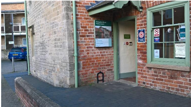
Ramp to side wheelchair entrance