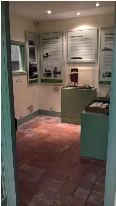
Entrance to Weighing Room showing floor surface