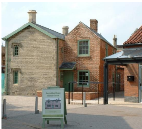
Wheelchair access via the side door.