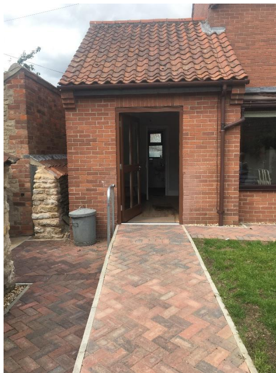
Ramp to side wheelchair entrance

ramped footpath to access Exhibition Area and