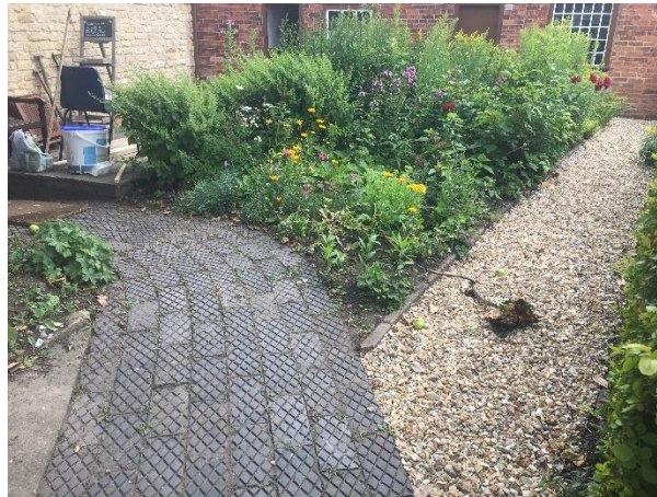
Pathway around Cottage Garden to Visitor Centre